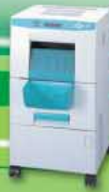
Printpix Digital Printer