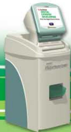
Digital Photo Center

A digital system that fits your budget and your space and generates more customers, more sales, and more profits.